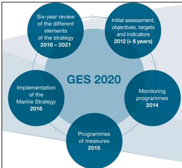
Figure 3. MSFD Cycle